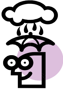
Are You Covered?

We need your help! Even though your insurance may renew automatically year-to-year, your policy declarations pages do not. Please call your agents and get those updated policies to us right away. Tip: if you list the Resort & Marina as the certificate holder or as additionally insured we will automatically get the updates and never have to bother you about it again! Now that's worth it!