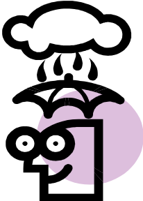
Are You Covered?

We need your help! Even though your insurance may renew automatically year-to-year, your policy declarations pages do not. Please call your agents and get those updated policies to us right away. Tip: if you list the Resort & Marina as the certificate holder or as additionally insured we will automatically get the updates and never have to bother you about it again! Now that's worth it!